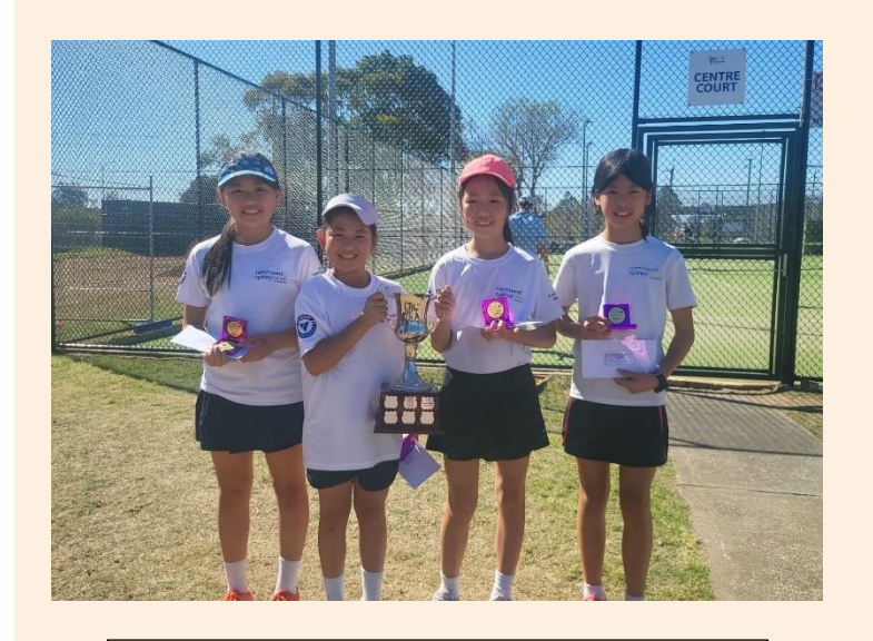
Holding the Harry Beck Cup – U10 Girls