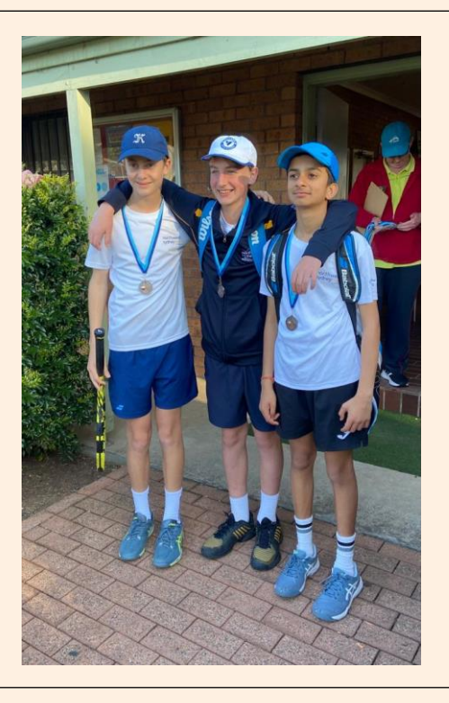
Esca Stephens Cup Div 3 Winners