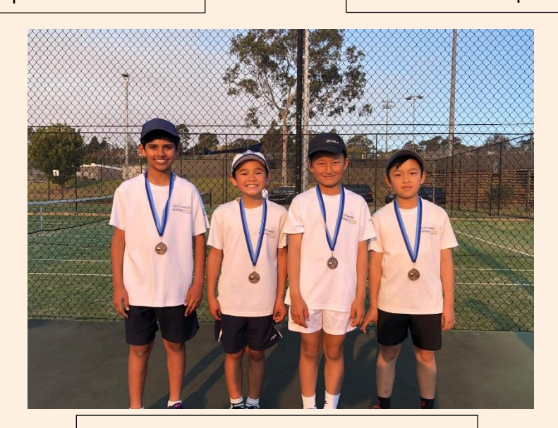
Stan Pederson Cup Div 3 - Winners