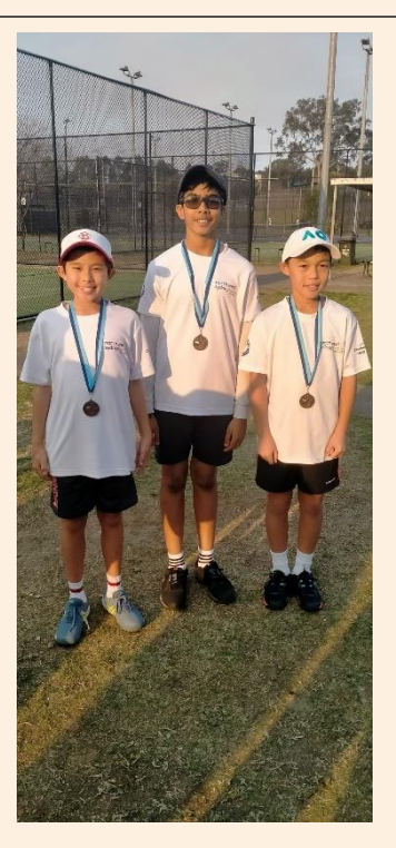
McAndrew Cup Div 4 – Runners Up